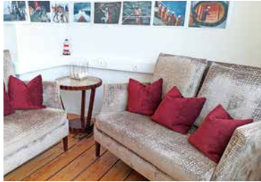
The Stella Maris Seafarers' Centre in Hamburg